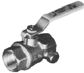
MODEL T/S - 100 ST SYSTEM-6