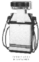
SOLEARES ELECTRONIC DISPENSER